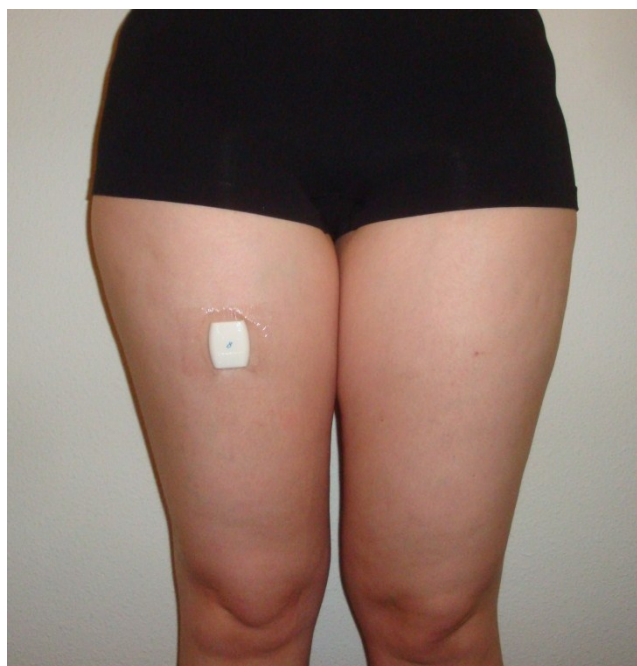
Figure 1. The Activ8 attached to the front of the less-affected thigh.

In the present study, the commercially available professional version was used and attached with Tegaderm™ skin tape to the front of the less-affected thigh, halfway between the hip and knee for the duration of the assessment (Figure 1). This is different from manufacturer’s instructions to place the Activ8 in a trouser pocket. This was done because previous measurements showed that this position can be applied in a more standardized way, would improve the accuracy of detection, and because not everyone has trouser pockets. Participants reported no negative influence from the Tegaderm™ skin tape in terms of the wearing comfort of the Activ8. It is a non-allergic medical skin tape which can be used for several days without complications.