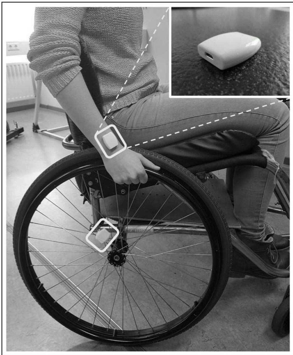
Fig 1. One Activ8 was attached to the distal dorsal side of the forearm and one to the right wheel. Picture was taken before securing the monitors with surgical tape.

https://doi.org/10.1371/journal.pone.0194864.g001